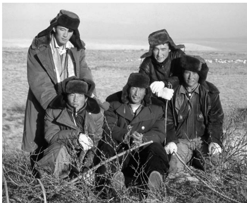
FIGURE 3 Group-herding arrangements make possible economies of size with respect to herd supervision. Illustrated is a Kazakh herding group in spring–autumn pasture, Burqin, Xinjiang. De facto collective tenure persists in this pasture in part because of its patchy nature and the related difficulty of subdividing it equitably between groups or households.

The local-level arrangements for grassland management described in the previous section are molded by the economic, social, and ecological realities of pastoralism in western China. Rangelands are by nature extensive, of low productivity per unit of area, and spatially and temporally variable. This makes the net benefit of establishing private exclusion through fencing marginal at best, which is reflected in the frequent comment of pastoralists that even if they wanted to fence their pastures, they could not afford to. Instead, exclusion is more economically achieved through a combination of collective or group tenure arrangements, which are associated with shorter boundaries to be monitored and enforced, the direct observation of herders in the field, and the stationing of grassland protector households to ensure seasonal exclusion. Collective and group tenure arrangements also facilitate group-herding arrange-